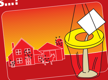
1. Prepare Trap